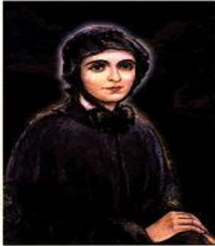
Elizabeth Ann Seton